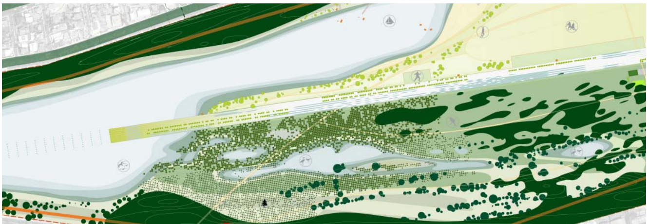
Illustrative Plan of Quito's Parque DeL Lago - crafting the park's terrain and hydrological networks sets the framework for the growth of the park over time