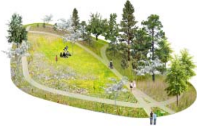
Waterside Way, Tring, UK

ECOLOGICALLY DRIVEN INFRASTRUCTURAL AND PERFORMATIVE URBAN LANDSCAPES