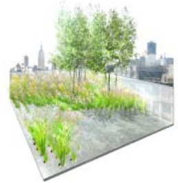
Prince Street Penthouse Garden, NY

m3project is an innovative landscape and urban design practice based in New York. The firm's work ranges in scale from the design of large city-regions to intimate garden spaces and resort destinations; the design of large public parks and urban infrastructural landscapes to housing and mixed-use developments; and from the reclamation of post-industrial landscapes to the preservation of large-scale natural resources. The practice is a dynamic and evolving interdisciplinary collaborative that responds to the shifting and advancing conditions of modern life. In the development of each project, inclusive of their varying scope, scale, territory, context, and economy, the design resolutions are driven with landscape as the organizing medium of conceptual articulation. The process excels in the synthesis of complex projects and aims to respond with imagination and clarity, crafting ecologically and culturally significant environments.