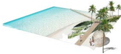
Phala Kung Marina Resort, Thailand